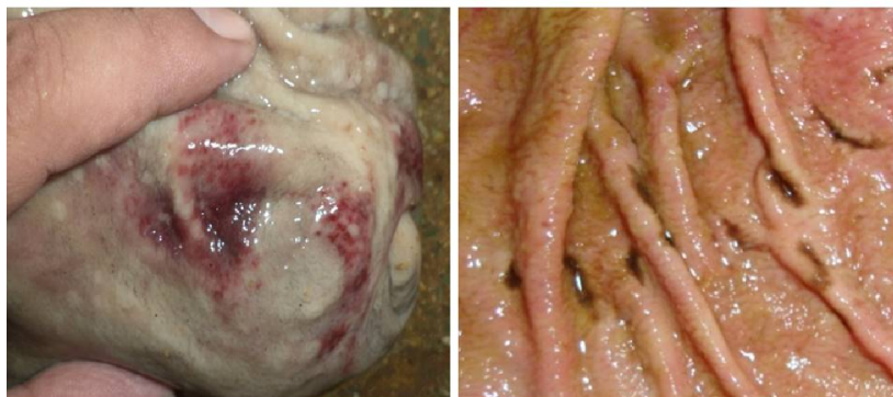
Fig. 1. Gross appearance of different degrees of type 1 abomasal ulcers.

The Shapiro-Wilk's test ( P>0.05 ), visual examination histograms, normal Q-Q plots and box plots showed that the plasma gastrin concentrations were approximately normally distributed for both the ulcer-negative and ulcer-positive buffaloes. Although our data were a little skewed and kurtotic, did not differ significantly from