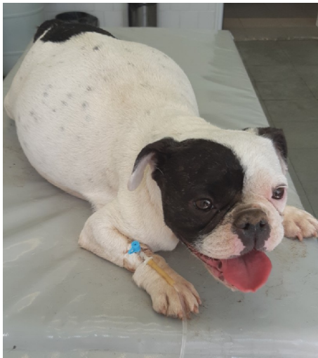
Fig. 1. The patient at the presentation at the clinic.

At inspection, the abdomen was very distended (Fig. 1). The vulva was oedematous and without any discharge. Transabdominal ultrasonography (Mindray DC-6 Vet, China, 6.5 MHz convex transducer) revealed a presence of fetal distress.