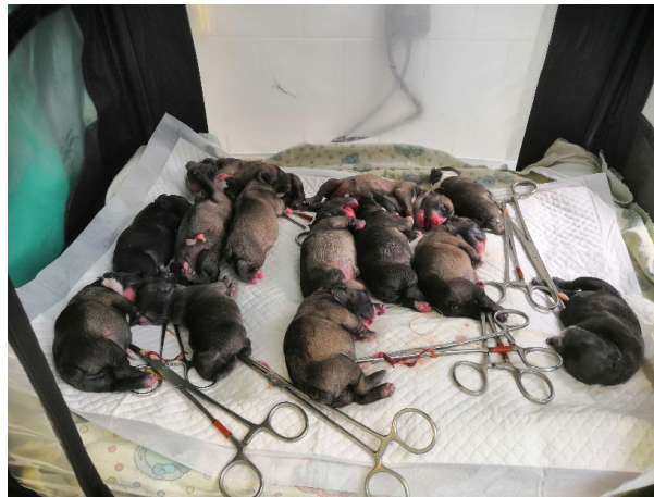
Fig. 2. Thirteen live French Bulldog puppies after the Caesarean section.

*Weiss & Wardrop (2010); **Kaneko et al. (2008); AST: aspartate aminotransferase; ALT: alanine aminotransferase.