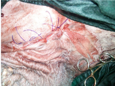
Fig. 6. Postoperative appearance of the inguinal area after correction of the hernia. The last stitch of the superficial inguinal ring incision was not knotted and a drain was applied through it to allow drainage of exudates.

In equine practice, acquired inguinal hernia is a common lesion in horses and is considered the second most frequent type after umbilical hernia diagnosed in these animals. There is no available report for this type of hernia in donkeys. Therefore, the goal of the present case series was to describe the presentation and surgical management of acquired inguinal/scrotal herniation for the first time in 11 working donkeys.