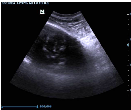
Fig. 3. Ultrasonographic image of the scrotal herniation in a gelding donkey. Note the appearance of the intestine in the scrotal sac.

Before herniorrhaphy, all cases were administered intravenously 22,000 IU/kg body weight sodium penicillin (Penicillin G sodium; Sandoz), 6.6 mg/kg gentamicin sulphate (Garamycin; Schering-Plough), and 1.1 mg/kg flunixin meglumine (Finadyne; Schering-Plough Animal Health). The donkeys were sedated using 0.8 mg/kg xylazine HCL (Xylaject; Adwia, Egypt) and 0.03 mg/kg butorphanol (Torbugesic; Zoetis), both administered intravenously. Anaesthesia was induced with 0.05 mg/kg diazepam (Valium; Roche)