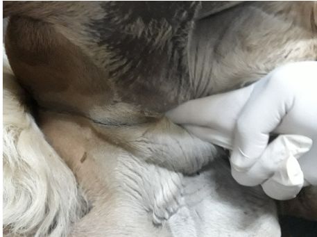
Fig. 2. Palpation of the superficial inguinal ring showing a reducible swelling in which the herniated intestine manually descended through the inguinal canal into the abdominal cavity.