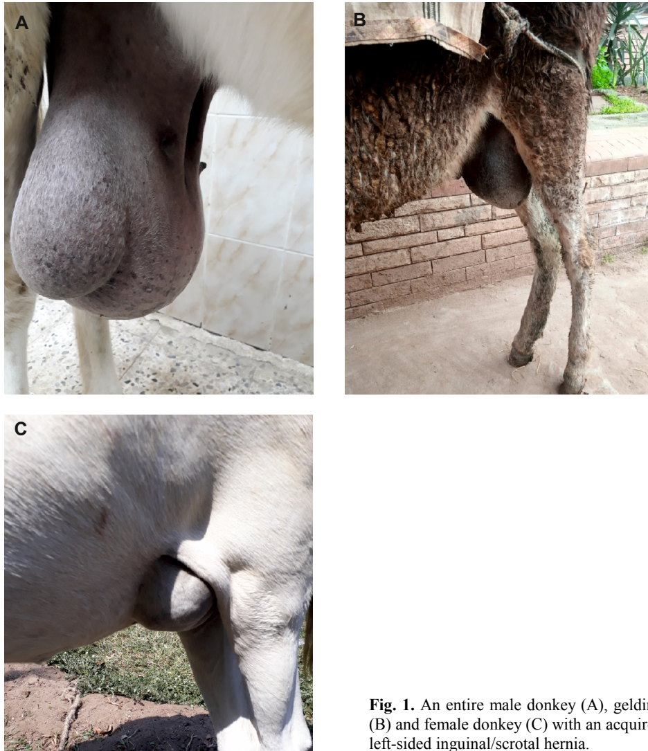
Fig. 1. An entire male donkey (A), gelding (B) and female donkey (C) with an acquired left-sided inguinal/scrotal hernia.

The percutaneous scrotal or inguinal region ultrasonography showed an intestinal loop that had moved into the scrotal cavity close to the testicle (Fig. 3). B-mode ultrasonographic images of the scrotum provided valuable information regarding the testis and the motility or viability of the herniated intestine. The testicle of the affected side was less echogenic than its normal counterpart. Addi-